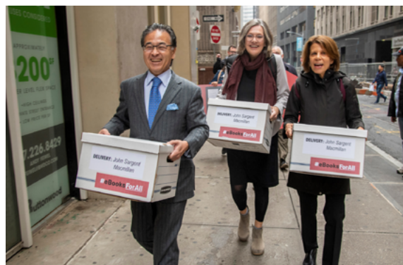
Boxes of signatures being delivered to the Macmillan offices

UPDATE: In March 2020, Macmillan canceled the embargo on sales of new titles to libraries and returned to the lending policy that was in effect on Oct. 31, 2019.